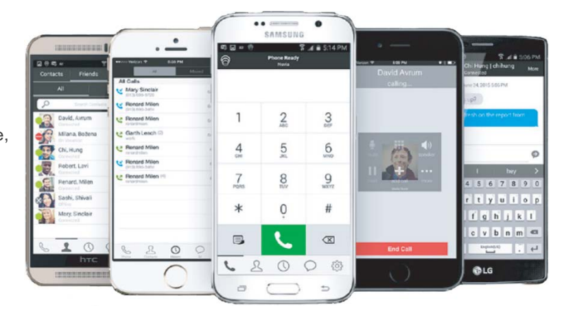
Smart Office for Mobile

For more information contact us through our website at temovi.cloud