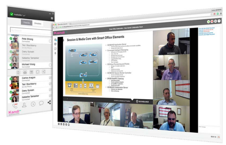
Smart Office Collaboration

The Temovi Application Server can be deployed in an enterprise premises, in a private cloud or as a hosted service in a service provider network. Regardless of deployment, the end user experience is the same.